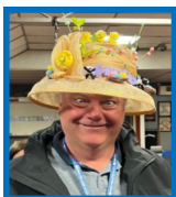
Strange sights on the site

The Easter rally was well attended with 25 units on the field, it was also great to welcome new and returning faces to our meet. There was, as always a full programme of events for all ages as well as chocolate treats for our young campers. Everyone enjoyed the party night in the hall and afternoon tea on the Saturday, always a highlight of the weekend. The weekend also raised £67 for our nominated charity, CHAS from donations given at the afternoon tea.